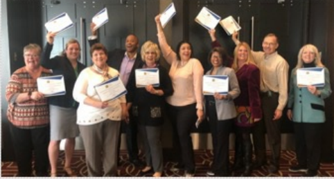
Project Patient Care: Bringing the voice of the patient, family, and caregiver to improve health and healthcare locally, nationally, and globally.